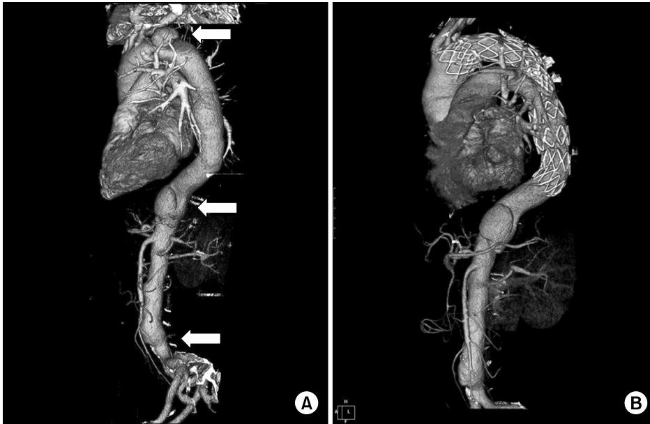
Fig. 1. (A) Preoperative three-dimensional reconstructed computed tomography (CT) image showing the multiple aneurysmal dilatations (arrows) in the aortic arch, proximal abdominal aorta, and distal abdominal aorta just above the iliac bifurcation, and (B) post-stent CT image.